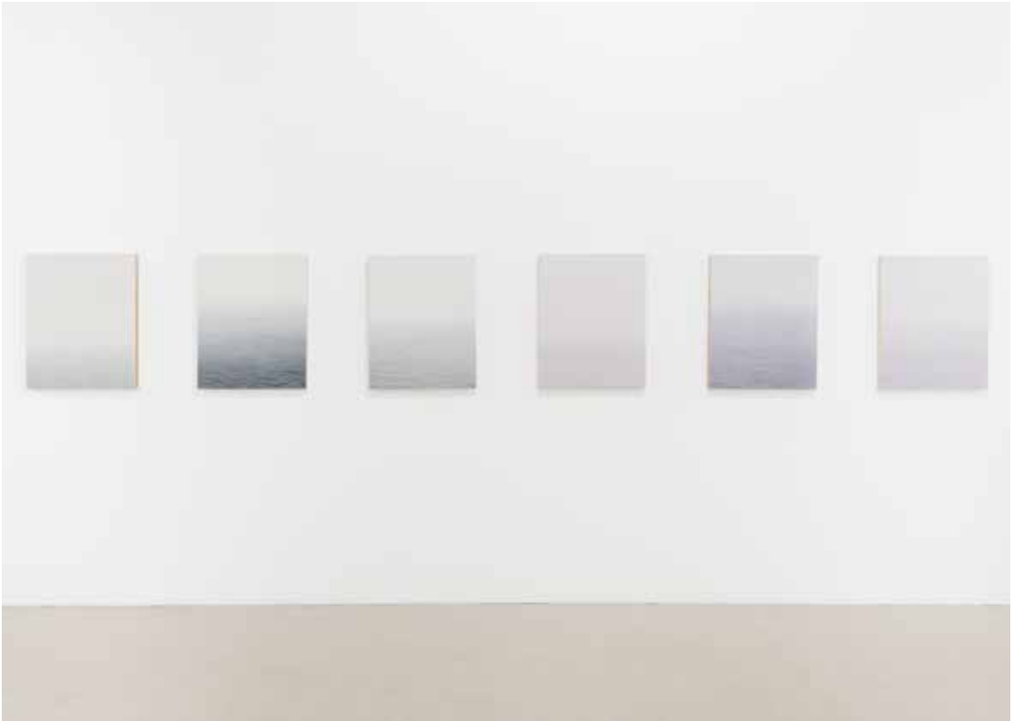
Rebecca Partridge — Notes on the Sea, Day , 2014