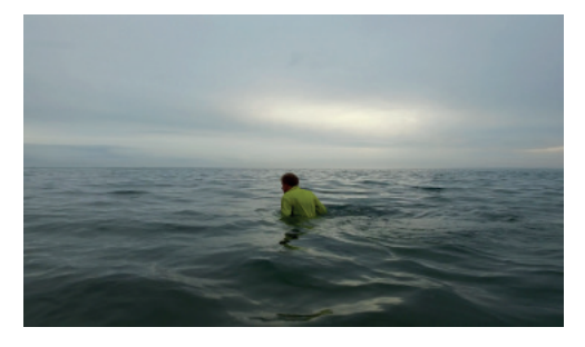
Going Nowhere 1.5 (Production Still), 2016 Digital photograph

For further details and images please contact: