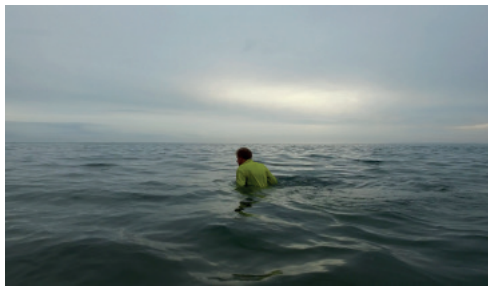
Going Nowhere 1.5 (Production Still) , 2016 Digital photograph

For further details and images please contact: